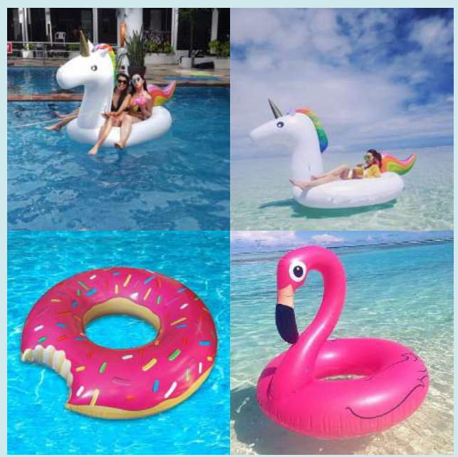
Float Rental - RM10/hour