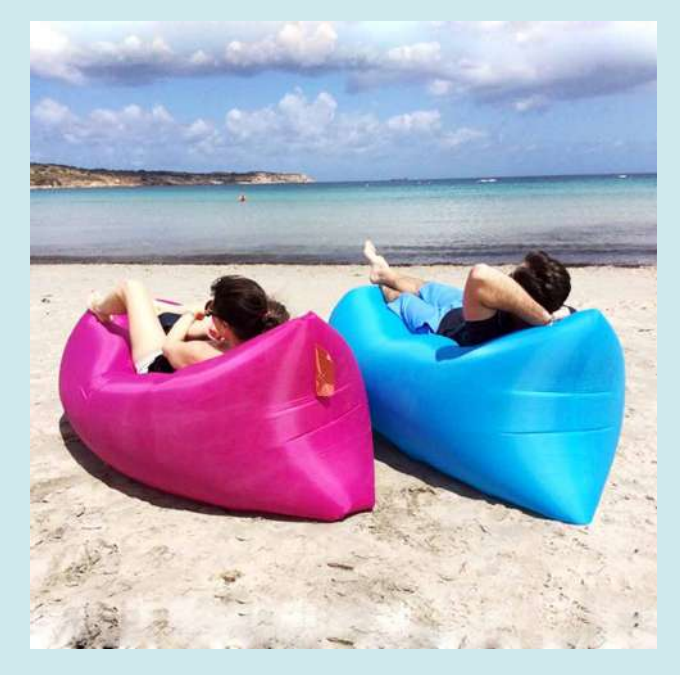
Air Sofa Rental - RM5/hour